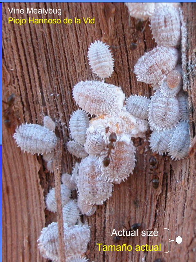
Vine Mealybug Piojo Harinoso de la Vid

El insecto adulto mide alrededor de 3 mm; se encuentra asociado con hormigas.