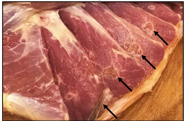
Figure 1. Arrows point to injection site lesions that span cuts of beef.