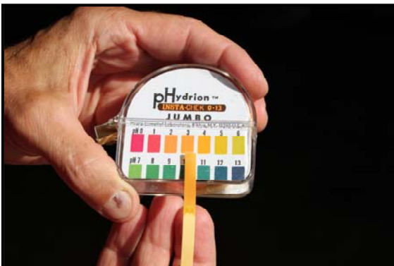
Figure 6. Check that the pH of the acid rinse is between 3 and 4.

Rinse the milking system with lukewarm (100 to 110 °F) acidified water for 3 to 5 minutes. Use your pH paper to check that the pH is between 3 and 4 (Figure 6). The acid rinse prevents any milk minerals from accumulating on surfaces. When minerals collect with organic material on equipment surfaces, milkstone (a white, chalky film) develops. Milkstone provides areas on contact surfaces for bacterial growth within the milking system. The acid rinse reduces the pH of the equipment, which helps to prevent bacterial growth between milkings. The acid rinse also neutralizes the chlorine and alkaline residues from the wash cycle and helps to prolong the life of any rubber parts.