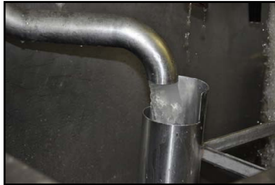
Figure 1. Residual milk rinsed from pipelines.