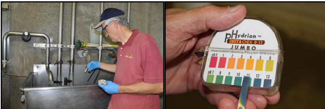
Figure 3. Check that the pH of the detergent solution is between 11 and 13. Remember to use safety equipment (gloves and goggles) to protect from splashing.

Why an alkaline detergent? Milk fat and water do not mix. The (basic) pH of the detergent breaks up any remaining milk fat into tiny droplets, suspending the fat in the detergent wash water. Use your pH paper to check that the pH is between 11 and 13 (Figure 3).