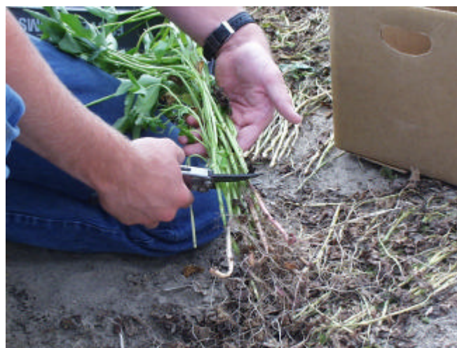
Cutting slips for research trials.

Don't forget to clean the boxes or crates used to transport slips from hot bed to field. If these containers were previously used and not cleaned, they could harbor soil and diseases that will contaminate your slips. Use a mild bleach solution for best results.