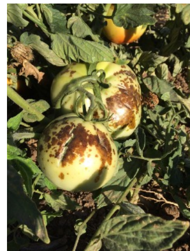
TSWV on resistant, late season fresh market tomatoes, 2018.